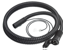
PlugIn inlet cable