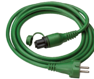
MiniPlug connection cable