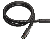
PlugIn extension cable