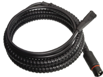
Termini™ extension cable