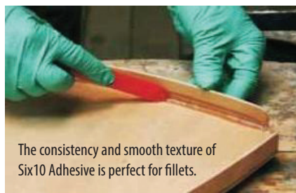
The consistency and smooth texture of Six10 Adhesive is perfect for fillets.

With the 600 Static Mixer attached to the Six10 cartridge, it's easy to lay down a bead of thickened epoxy adhesive right where you need it.